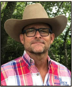
'Papa B' Feeling The Love!

When we moved from our East Texas ranch to the Bryan/College Station area, we 'inherited' a BIG BUNCH of kids. Jake and Jess were at Texas A&M and both have huge friend groups.