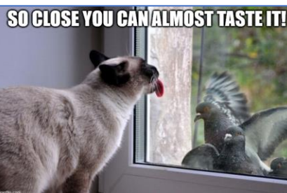
Watch this space next month!