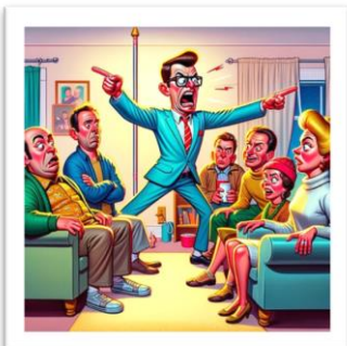
The Airing of Grievances