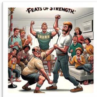
Feats of Strength