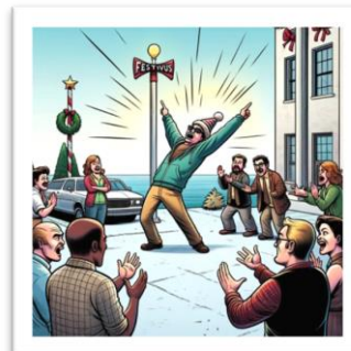
The Festus Miracle