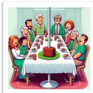
The Festus Dinner