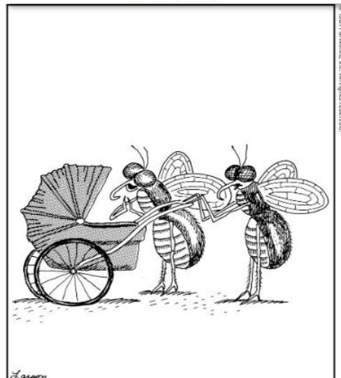
"Oh, my! ... What a cute little maggott!"