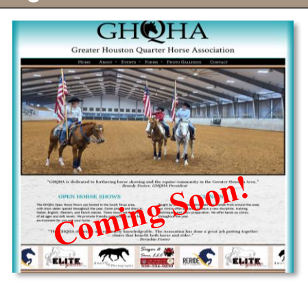
Greater Houston Quarter Horse Assn GHQHA.com Houston, Texas