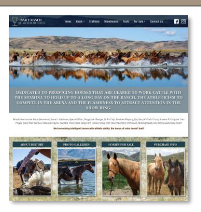
Bar Y Ranch Quarter Horses BarYQuarterHorses.com Geneva, Idaho & Kingman, Arizona