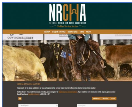
NRCHA Stallion Auction NRCHAStallionAuction.com Pilot Point, Texas