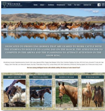
Bar Y Ranch Quarter Horses BarYQuarterHorses.com Geneva, Idaho & Kingman, Arizona