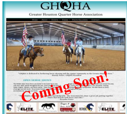
Greater Houston Quarter Horse Assn GHQHA.com Houston, Texas